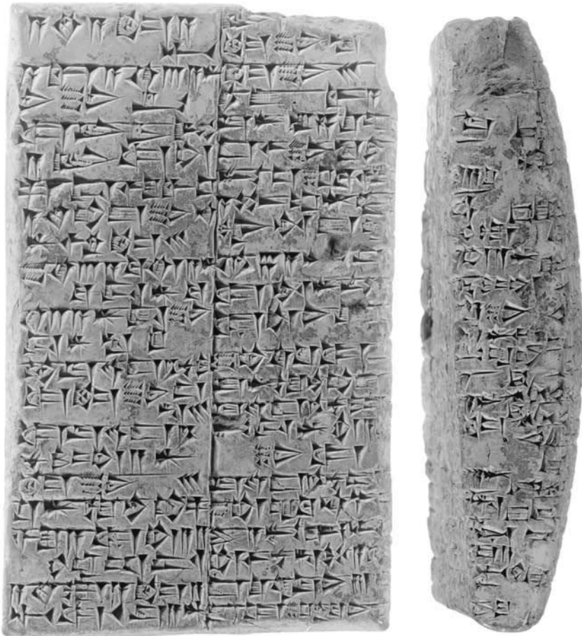
Fig. 1. AO 6047 obv.