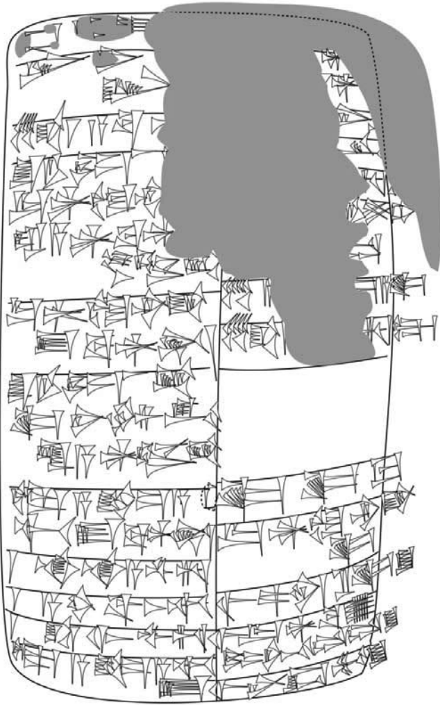
Fig. 5. BM 105339 obv. (drawing)