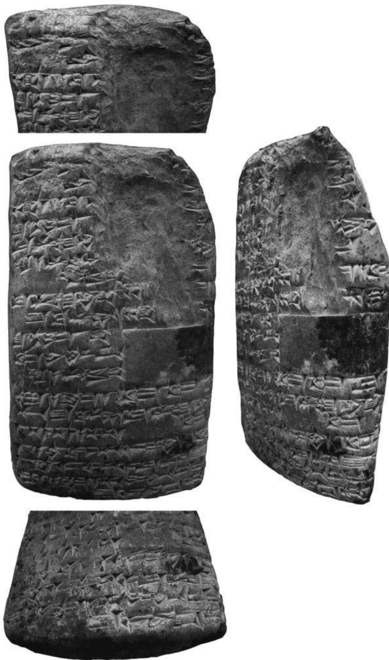
Fig. 3. BM 105339 obv.