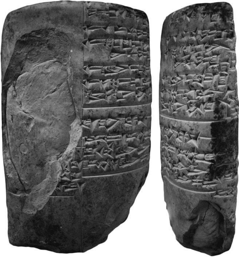
Fig. 4. BM 105339 rev.